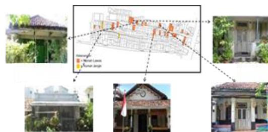
Figure 3. The map of the houses existing for more than 50 years old and with relatively unchanged appearance (Colonial architecture style)

The houses used as sample were selected based on their strong potential sense of place as indicated by having being in existence for more than 50 years, located in an alley, on the edge of a village road/facing an alley, and relatively unchanged physically as well as the willingness of the owner to participate. The location and position of some of the selected houses are presented in figure 3.