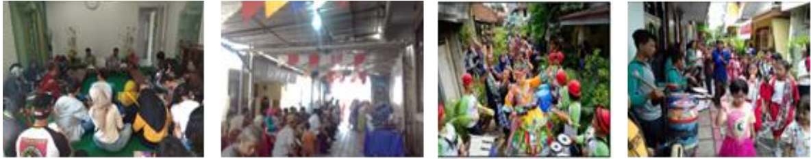
Figure 4. Social and cultural activities (conferences, village festivals and patrol music)

The following table shows the results of the questionnaires distributed to 175 respondents in Lawas Maspati Village based on the criteria that they have lived for more than 20 years and are over 40 years old.