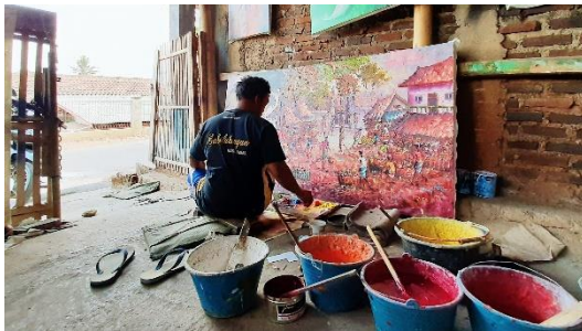
Figure 3. Art activities

The following table shows the results of the questionnaires distributed to 175 respondents in Lawas Maspati Village based on the criteria that they have lived for more than 20 years and are over 40 years old.